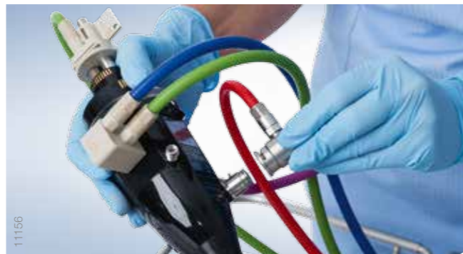
Color-coded adaptation principle.