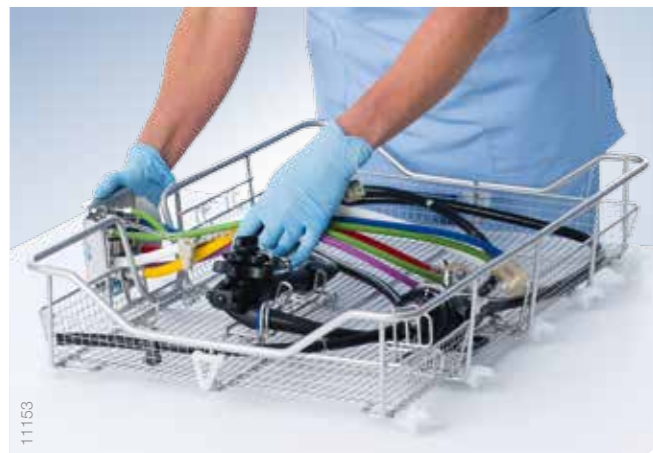
11153 Loading of baskets and connection of endoscope channels fully outside the ETD Double.

This innovative principle significantly simplifies the connection of endoscope channels.