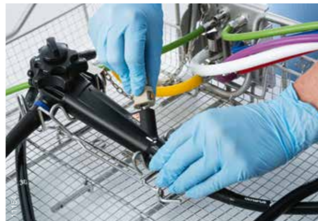
Easy connection of endoscopes.