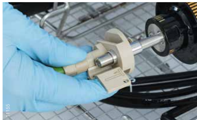
Mechanically coded adapter with laser-engraved icon.

The automated leakage test of the ETD Double provides you with precise and stable sensors and pumps for high detection rates of even the finest leaks.